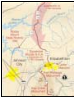
Detail from current Commemorative Motor Route map

During 2005, the official visitor use map of the OVNHT will be released by the National Park Service. (The current map in popular use is for only the Commemorative Motor Route.)