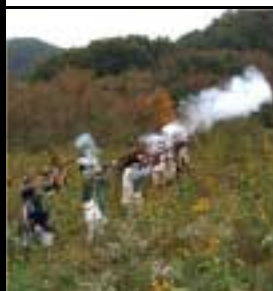
Members of OVTA fire a volley in the Hampton Creek meadow saluting the militiamen who traveled here in 1780.