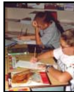
Students write in their journals about the Overmountain Men

Those extensive and comprehensive educational materials have been published and distributed to interested teachers throughout the trail's four-state area. All teachers continue to access the PDF materials through the official OVNHT website at www.NPS.gov/ovi . The materials can be found under "Management Documents." They include vocabulary lessons, reading materials, quiz games, writing and math exercises, outdoor activities and the 12-episode serial Footsteps for Freedom . All the exercises tie into goals set out by the North Carolina Standard Course of Study for Social Studies.