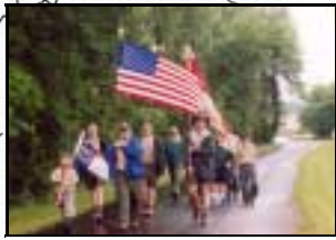
Yadkin River Greenway, North Wilkesboro, NC