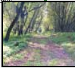
OVNHT along Yadkin River, Elkin, NC