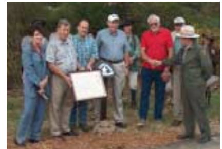
Officials and volunteers at Roan Mountain celebrate designation of the OVNHT Trail along the Doe River.