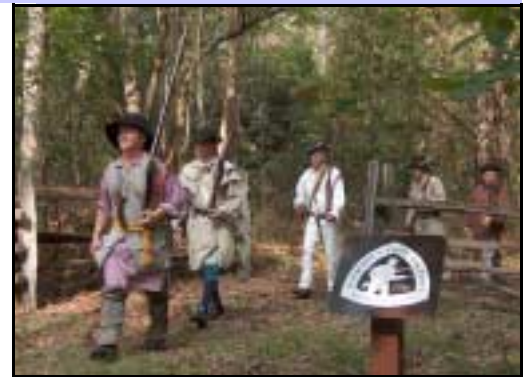
OVTA marchers advance into the Pisgah National Forest along a new section of the OVNHT.