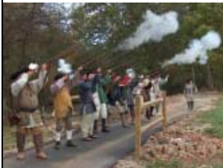
OVTA fires a volley at Roan Mountain Community Park to honor the 1780 Patriots.

new trail to that which has already been designated. This will enable future visitors to walk along the Doe River for an extended hike and to relive the experience of those Patriot heroes over 200 years ago.