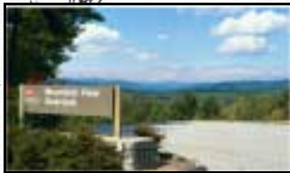
W. Kerr Scott Dam & Reservoir, Wilkes Co, NC