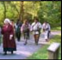
Yadkin River Greenway Morganton, NC