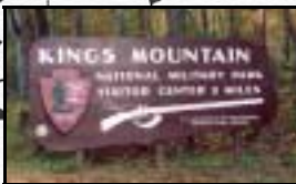
Kings Mountain National Military Park, York Co., SC

September 30 – The two groups of Overmountain Men ride along separate routes near the Catawba River and reunite along the way. They camp at Quaker Meadows where they are joined by the Wilkes-Surry militia and others. The spirit of the men is lifted as the band of Patriots grows in number.